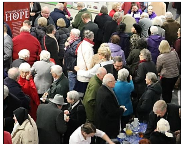
The crowds gather at Carmel College

Bishop Séamus is convinced that partnerships will enable formation programmes to be developed and delivered locally; that smaller communities can be supported; that the gifts, talents and financial resources in a wider area can be put at the service of more people and that a thorough review of all property will need to be carried out in the near future. Those present were given an 8-page document which included maps of every area of the diocese and which set out the new partnership arrangements. The full document, presentation slides from the evening and a video of the Bishop's message are available from the website - www.hope.rcdhn.org.uk